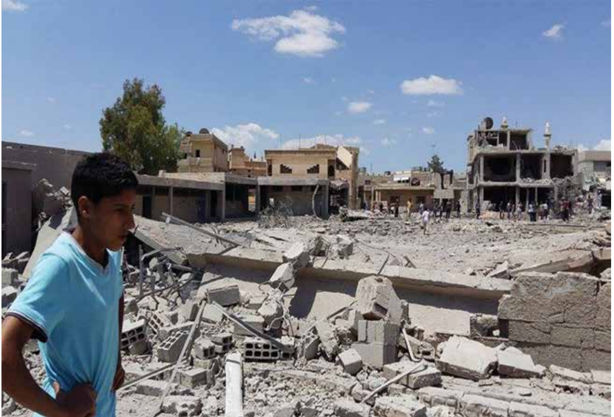
Palestinian child overlooks destroyed UNRWA school in Khan Eshieh camp in Syria.