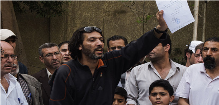
Palestinians displaced from refugee camps in Syria shout protest against the Palestinian ambassador in Cairo, April 23, 2013. (photo by GIANLUIGI GUERCIA/AFP/Getty Images) http://www.al-monitor.com/pulse/originals/2014/08/egypt-government-force-palestinians-return-gaza-syria.html#ixzz4SpOR8pFD

Palestinians from Syria are coerced into their departures. Unprotected, they are subjected to refoulement , despite customary international law. For both Syrians and Palestinians, government imposed restrictions remain intact. Even though the Palestinian Authority has formally intervened and requested for the release of the refugee detainees, Egypt's Foreign Affairs and National Security refused. (106)