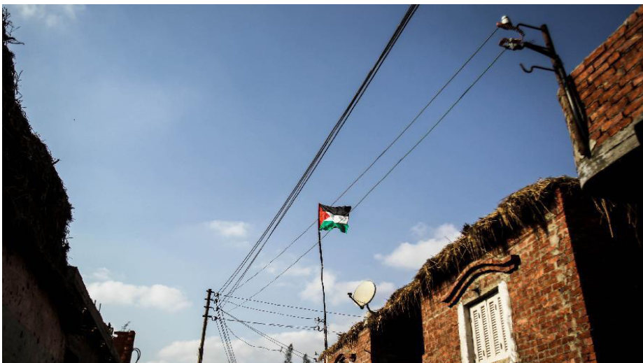
A Palestinian flag is seen in Fadel Island refugee camp in Sharqia, 90km northeast of Cairo, Egypt, June 10, 2013.

Yet in 1988, Land Law 104 amended Law 15 of 1963, and those changes made in 1985. This law stipulated different conditions for foreign ownership of land: the surface area of the property must not exceed 3,000 square meters and property subject to the law of archaeology protection cannot be owned by a foreigner. (95) Those most impacted were Palestinian individuals and companies now barred from ownership of agricultural property and fertile lands in Egypt. Palestinians who owned land were required to terminate their agricultural landholdings within five years or face seizure of their property by the government. (96) Some of those who owned agricultural land relied on it as a guarantee for regular residency renewal. (97)