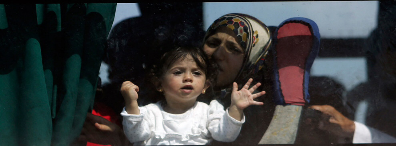
A girl and her mother, who are hoping to cross into Egypt, look out a bus window as they wait at the Rafah crossing between Egypt and the southern Gaza Strip July 16.