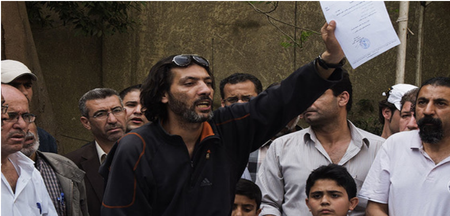
Palestinians displaced from refugee camps in Syria shout protest against the Palestinian ambassador in Cairo, April 23, 2013. (photo by GIANLUIGI GUERCIA/AFP/Getty Images) http://www.al-monitor.com/pulse/originals/2014/08/egypt-government-force-palestinians-return-gaza-syria.html#ixzz4SpOR8pFD

Palestinians from Syria are coerced into their departures. Unprotected, they are subjected to refoulement , despite customary international law. For both Syrians and Palestinians, government imposed restrictions remain intact. Even though the Palestinian Authority has formally intervened and requested for the release of the refugee detainees, Egypt's Foreign Affairs and National Security refused. (106)