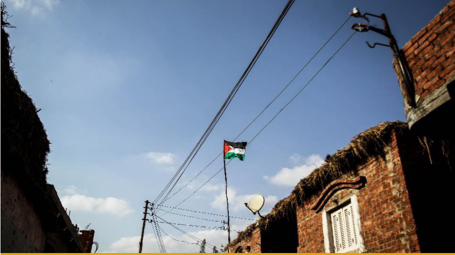
A Palestinian flag is seen in Faddel Island refugee camp in Sharqia, 90km northeast of Cairo, Egypt, June 10, 2013.

Yet in 1988, Land Law 104 amended Law 15 of 1963, and those changes made in 1985. This law stipulated different conditions for foreign ownership of land: the surface area of the property must not exceed 3,000 square meters and property subject to the law of archaeology protection cannot be owned by a foreigner. (95) Those most impacted were Palestinian individuals and companies now barred from ownership of agricultural property and fertile lands in Egypt. Palestinians who owned land were required to terminate their agricultural landholdings within five years or face seizure of their property by the government. (96) Some of those who owned agricultural land relied on it as a guarantee for regular residency renewal. (97)