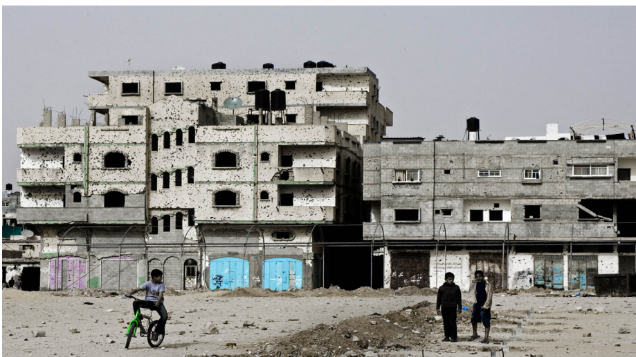
Rafah border with Egypt, The houses/flats on the 'front line' with the Egypt border see constant gun battles with Israeli military

Under Hosni Mubarak's government beginning in 1981, Sadat's policies and measures were initially kept intact with respect to employment and education restrictions. However, diplomatic ties were restored with the Palestine Liberation Organization (PLO) in 1983. But anti-Palestinian sentiments mounted again during the 1991 Gulf War after PLO leader Yasser Arafat expressed support for Iraqi leader Saddam Hussein's invasion of Kuwait. However, a glimpse of hope appeared again in 2004 with the passing of the 1975 Nationality Law, which granted Egyptian women married to Palestinian men the right to pass Egyptian nationality to children born after 2004. (10)