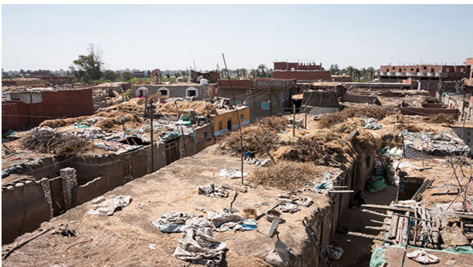
The village of Jezerit el Fadil is small, with houses built of a combination of mud brick, straw, and concrete. The entire village is ringed with tall mud walls, separating them from Egypt.