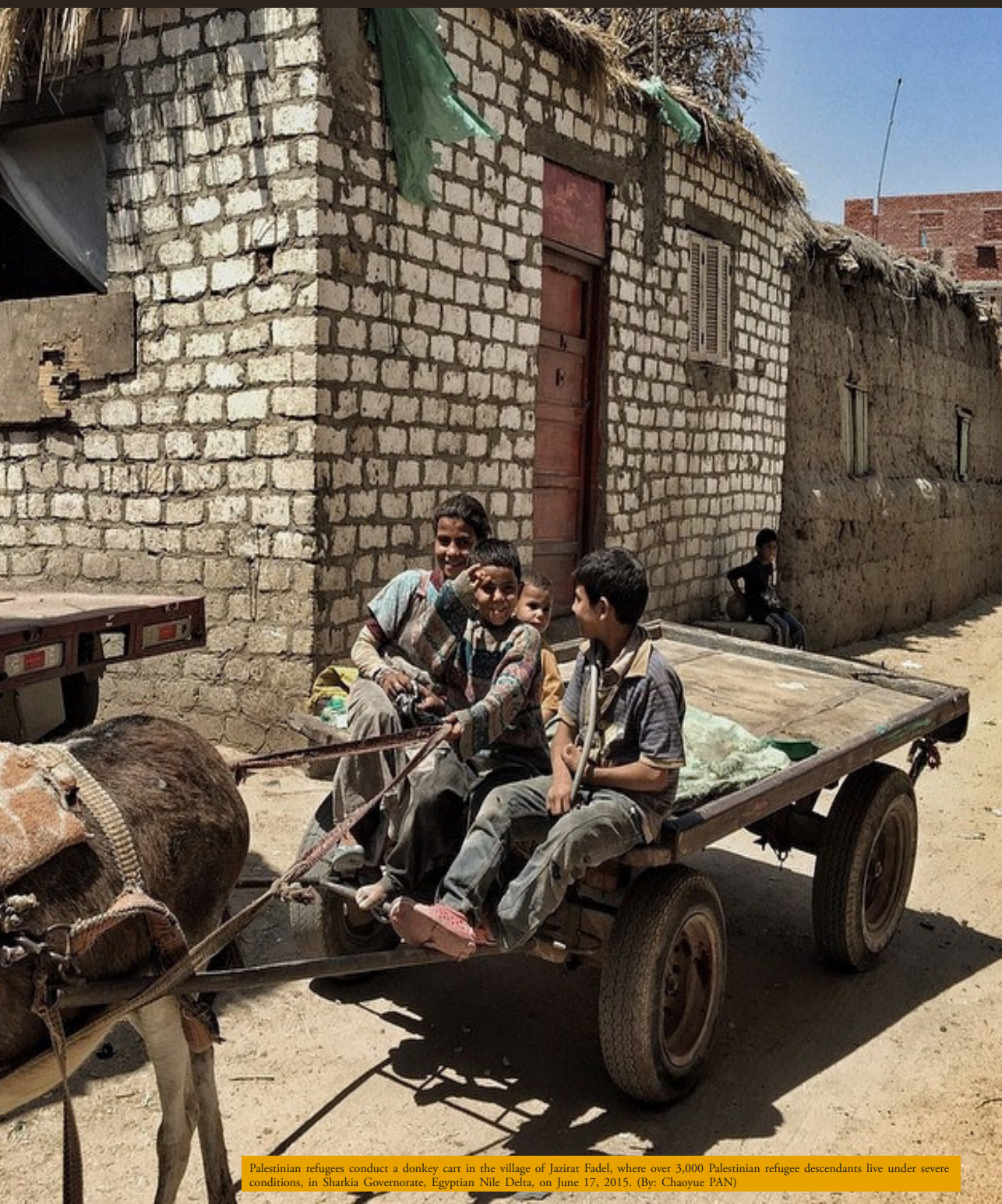
Palestinian refugees conduct a donkey cart in the village of Jazirat Fadel, where over 3,000 Palestinian refugee descendants live under severe conditions, in Sharkia Governorate, Egyptian Nile Delta, on June 17, 2015.